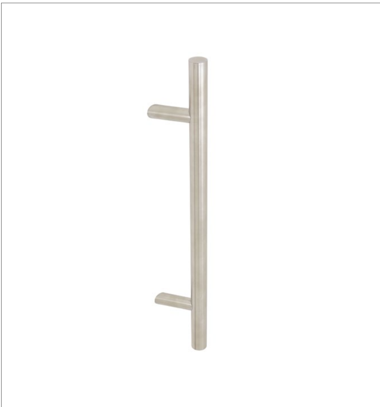
DDA Compliant - 316 Marine Grade Stainless Steel